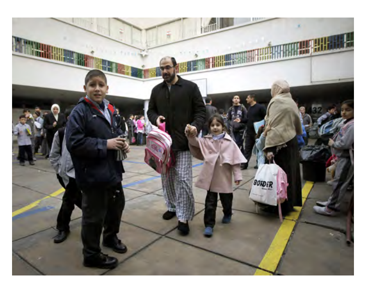
■ Both teachers and students have been out of the classroom

Despite the critical position of public and private schools, answers to the problem are limited by a lack of funding. However, even when external financial support has materialized in the past, it has