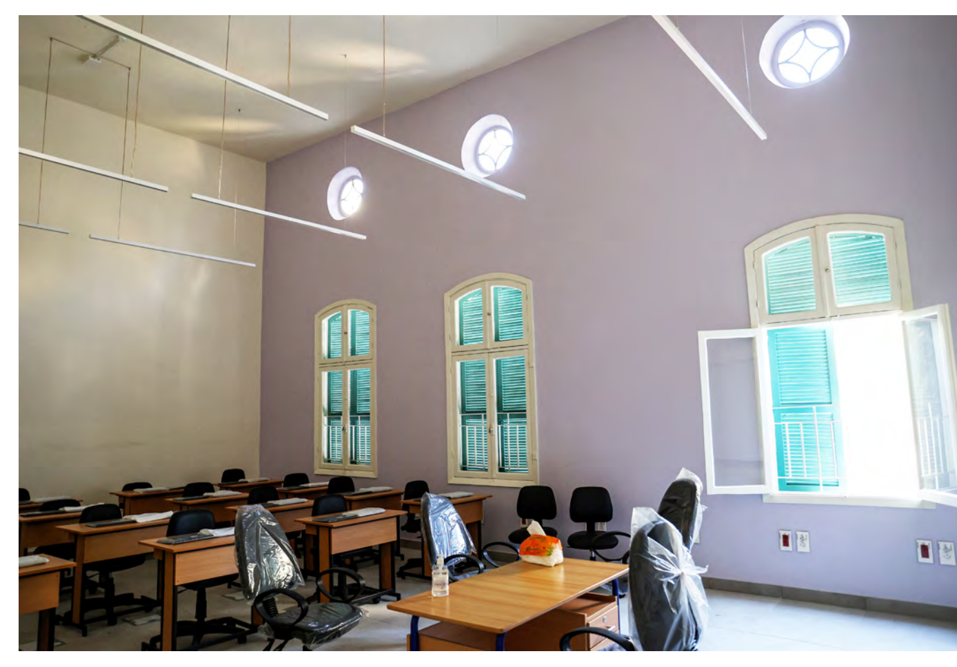
■ The education system has performed better than expected when confronted with unexpected challenges such as the influx of Syrian refugees

bridging program" to children who have been out of school for one year or more. The program, which is currently in its pilot phase, is designed for collaboration with private schools in providing learners with "multiple flexible pathways" to improve their societal and economic productivity.