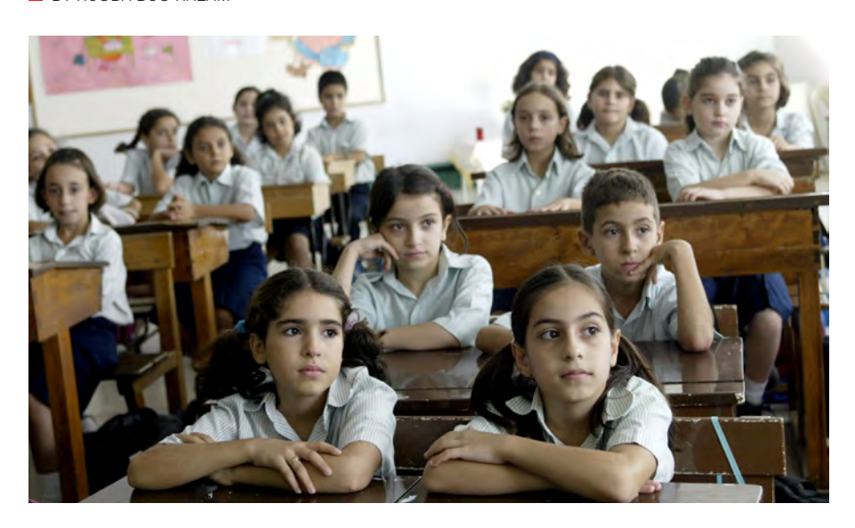
WIDENING INEQUALITY IN ACCESS TO EDUCATION COULD UNDO YEARS OF PROGRESS

Education is the cornerstone of a nation's progress, and it is often touted as a powerful tool for achieving equality and social mobility. However, in today's Lebanon, the situation is quite different. The country is facing a widening inequality in educational opportunities, threatening the future of its youth and its development prospects.