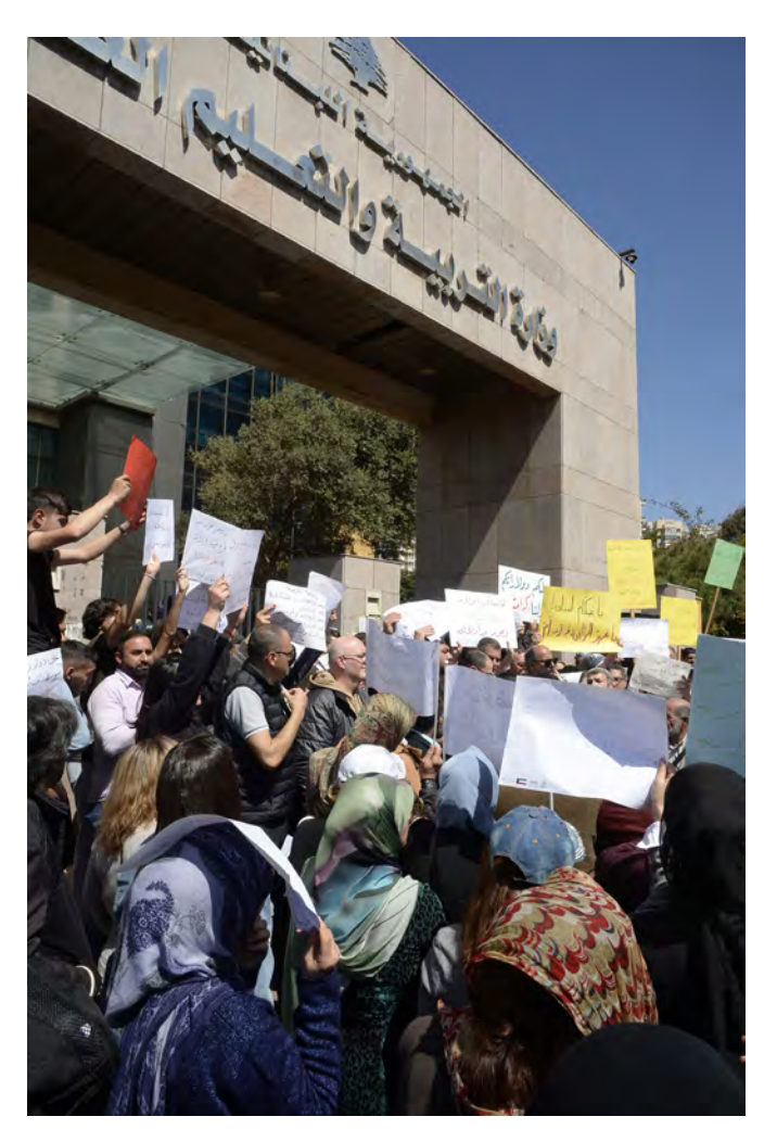
■ The fiscal misery suggests that Lebanon will be allocating less to education in percentage of GDP

same figure of about $1.2 billion in annual public spend on education but associates it with "approximately 2.45 percent of GDP and 6.4 percent of total public expenditure."