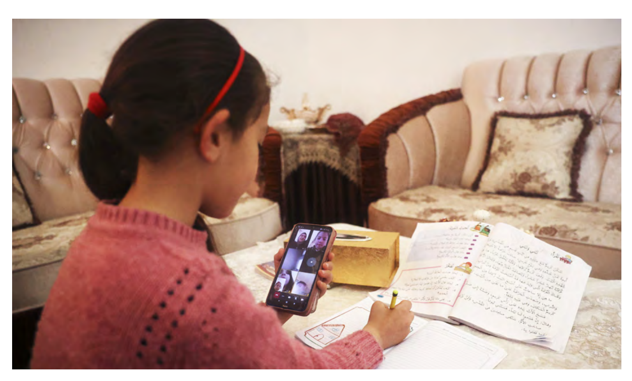
LEVERAGING TECHNOLOGY CAN HELP MANY CHILDREN LIVING IN LEARNING POVERTY

Every one of you reading this today can understand this simple sentence. However, almost two thirds (59 percent) of children in the Arab world are in 'learning poverty'—which means they cannot read and understand an age-appropriate text in Arabic by the age of 10. This is a problem for schools and parents across the Arab world, including in high income countries in the Gulf. With two thirds of the Middle East and North Africa's (MENA) 50 million children in learning poverty, this is an urgent problem that is holding back our region's development and progress. To succeed in solving this problem, any solution must find ways to (1) modernize outdated teaching practices, (2) close the gap between Modern Standard and spo-